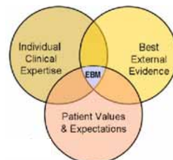
FIGURE 1. Evidence based medicine triad

EBM application means relating individual clinical signs, individual clinical experience with the best scientific evidences obtained by the clinical research (2). The revised and improved definition of evidence-based medicine is a systematic approach to clinical problem solving which allows the integration of the best available research evidence with clinical expertise and patient values. Under the individual clinical noticing we thought of the ability, skill that doctors acquired during years of clinical practice, and clinical experience is necessary and indispensable part that makes a good doctor. The best scientific evidence is considered to be a randomized controlled clinical study conducted on the amount of respondents that can prove the effectiveness of many drugs, as well as the harm and the inefficacy of others in comparison with the best existing therapy (3). The practice of evidence-based medicine is a process of lifelong, self-directed, problem-based learning in which caring for one's own patients creates the need for clinically important informa-