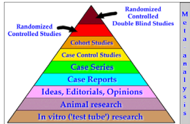
FIGURE 2. Types of research

cine is the growing number of examples, in which current medical practice cannot cope pace with the